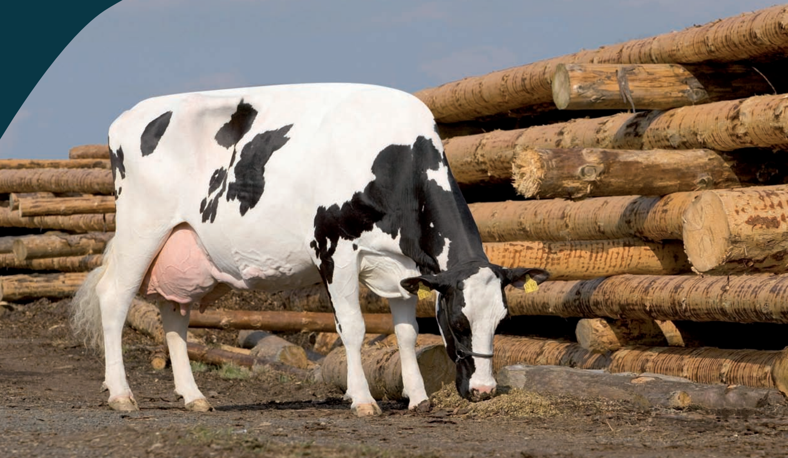
Gibor-daughter Hilla, 6 La