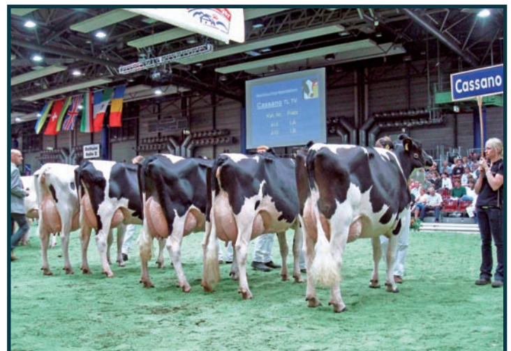
Progeny group of top sire Cassano

heifer class. This stylish, juvenile heifer with lots of development potential descends from a Jedstar-dam.