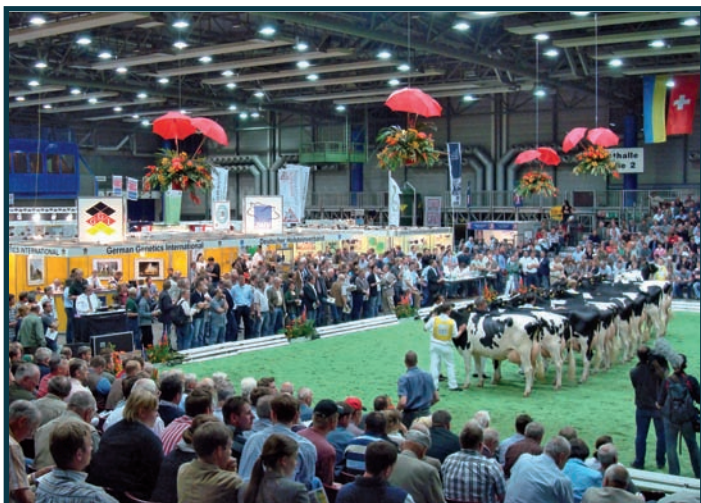
Big audience and many impressive Holstein groups

Daughter groups of bulls for the future Aspen, Elite, Mirror, Radon, Rainman, Tilo and Vincente were shown without or with preliminary breeding indexes. As well as current top sires, Cassano, Ruacana, Sallas and