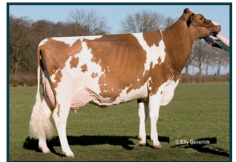
Carmano -daughter Alone , 3 La

Jerudo as the highest active bull has almost unchanged figures with his daughters now in 2nd lactation and is in high demand (RZM 127, RZE 123, RZS 112). Malvoy gains 2 points