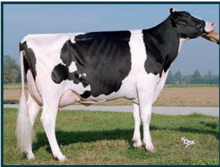
Jardin -daughter Barbie (Italy)

Mascol still maintains his top position with almost 4,000 German and over 2,000 international daughters. Gibor now ranks No. 2 with steady figures and more than 11,000 daughters. The highest newcomer is Radon at No. 3. He is the first Ramos-son to overtake his famous sire by combining excellent functional traits with lots of milk and +0.10% protein (see bull portrait). The highest O-Man-son and new in the top-10 is Orcas . He excels in milk production with +1,847kg and +0.12% protein (RZM 136). For functional traits he is a true O-Man: RZS 110, RZR 110, RZN 113. In addition to Orcas, three more new O-Man-sons complete the list. Omercy (MGS Blitz) breeds exceptional size and depth combined with lots of milk (+2,041kg, RZM 132). Omro